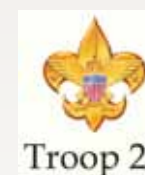
Christmas Tree Sale Underway

We will have our second Blue Christmas Service on Sunday, December 18, at 6:00 PM.